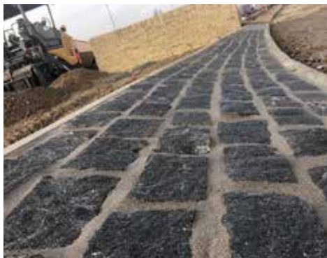
⤴ ProJoint™ V400-WT (mid grey) used in the Leeds M1 Skelton Lake motorway services