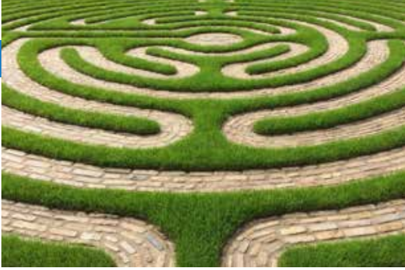
^ ProJoint™ V75-WT (neutral/buff) used in this fabulous decorative labyrinth