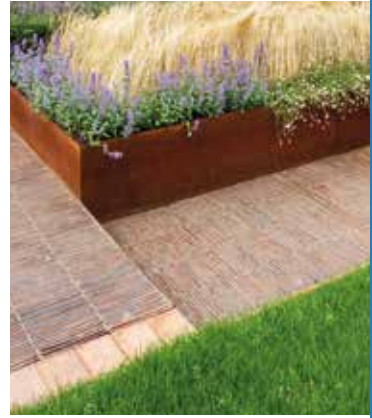
>> ProJoint™ V75-WT (neutral/buff) was used in an award-winning Chelsea garden - see 'Case Studies' on page 47 for more details